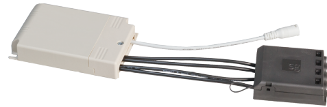
SENSE 1400mA/5000lm DRIVER DALI

Verpackung Verpackungsmaße (mm): 400 x 45 x 100